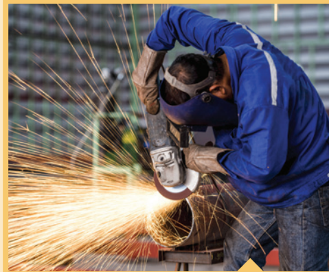
⊘ Workers exposed to lead