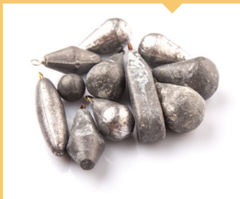
⊘ Fishing and hunting supplies