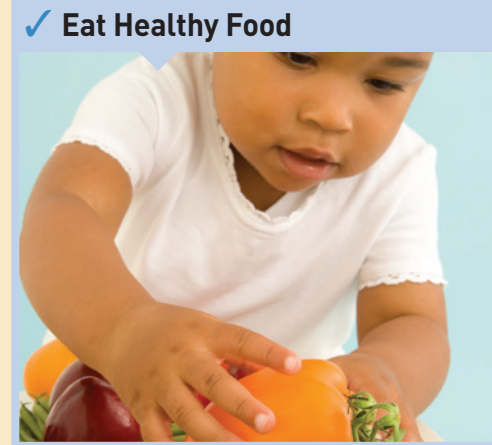
✓ Eat Healthy Food