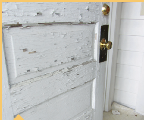
⊘ Lead paint inside older homes