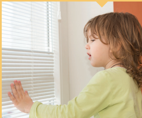
⊘ Vinyl or plastic mini-blinds