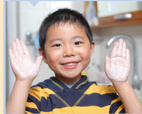
✓ Wash Hands and Toys