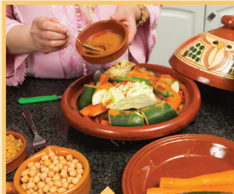
⊘ Imported spices