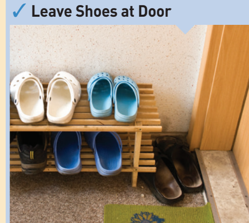
✓ Leave Shoes at Door