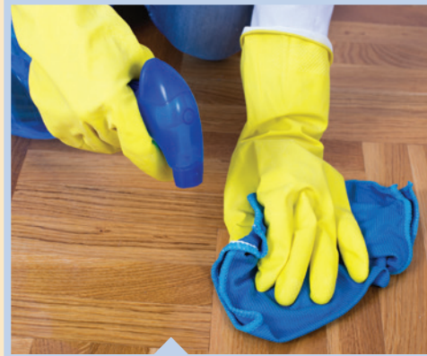
✓ Wet Clean