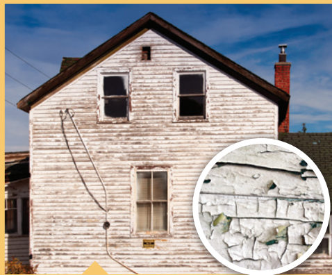
⊘ Lead paint outside older homes