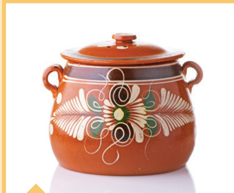
⊘ Lead-glazed pottery