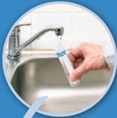
✓ Use Safe Drinking Water