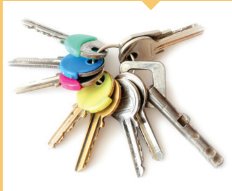
⊘ House and car keys