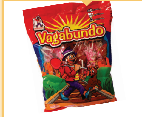
⊘ Imported candy