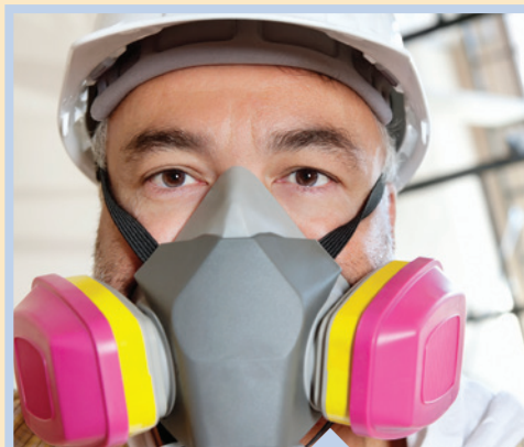
✓ Hire a Professional