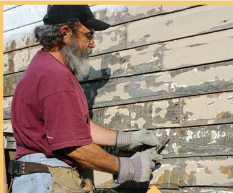
⊘ Unsafe home repair