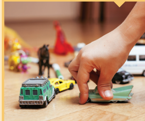
⊘ Toys and toy jewelry